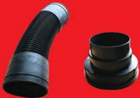
Adaptors and Flexible Pipe